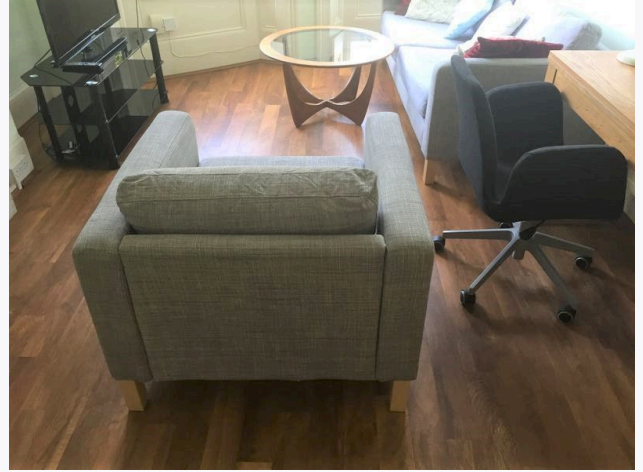
Ref # 2.1