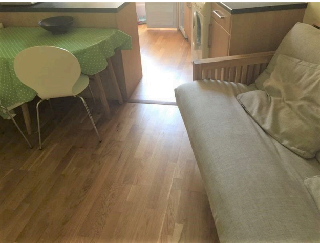
Ref # 2.1