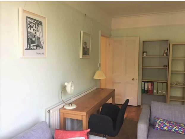
Ref # 2.1