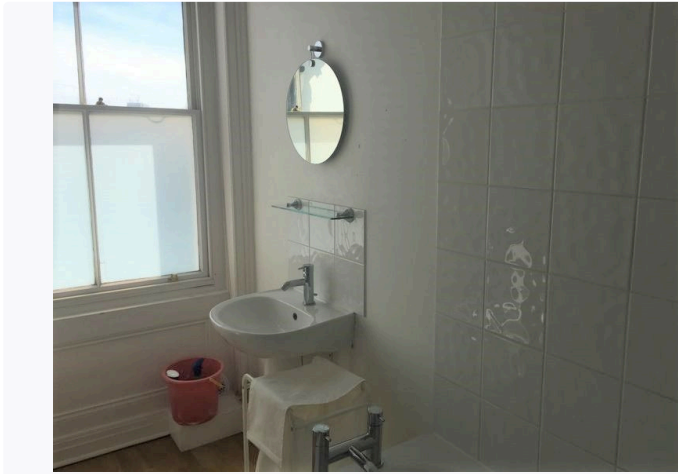
Ref # 2.4