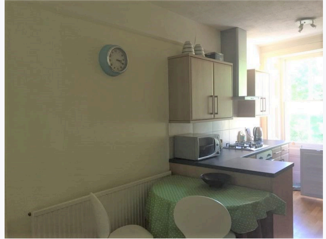
Ref # 2.1