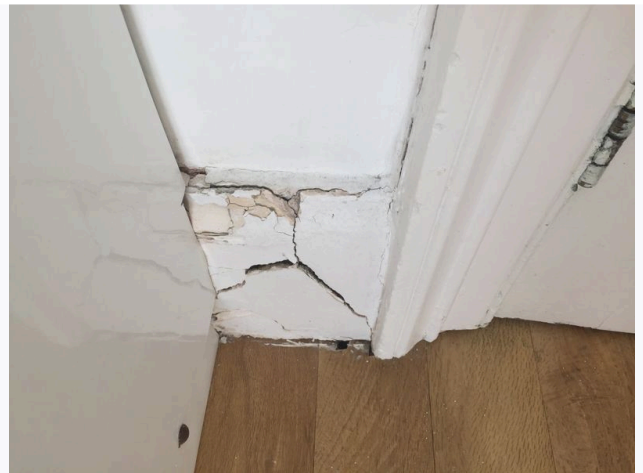
Ref # 2.3