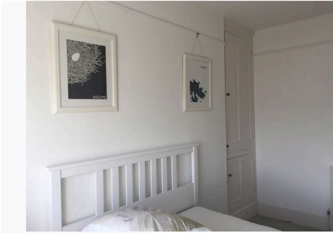
Ref # 2.3