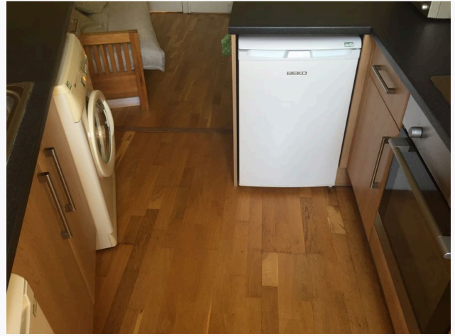
Ref # 2.2