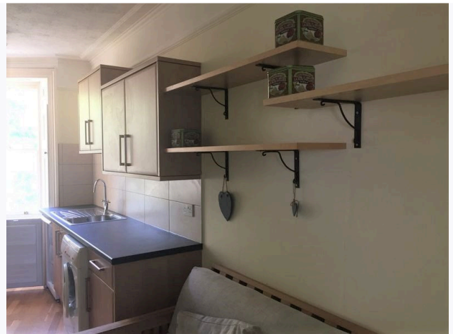
Ref # 2.2