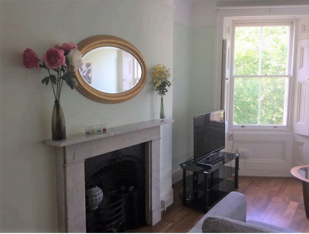
Ref # 2.1