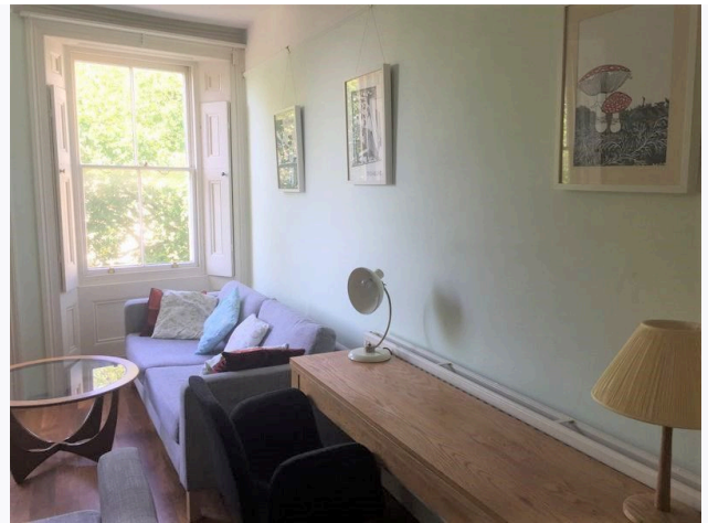
Ref # 2.1