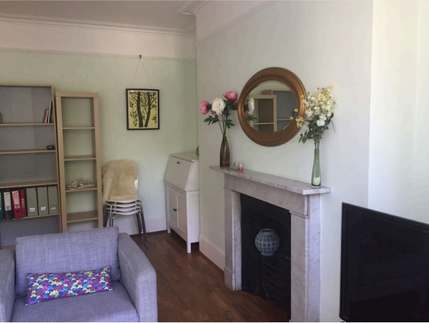
Ref # 2.1