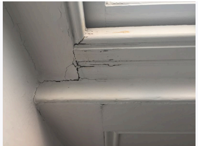
Ref # 2.4