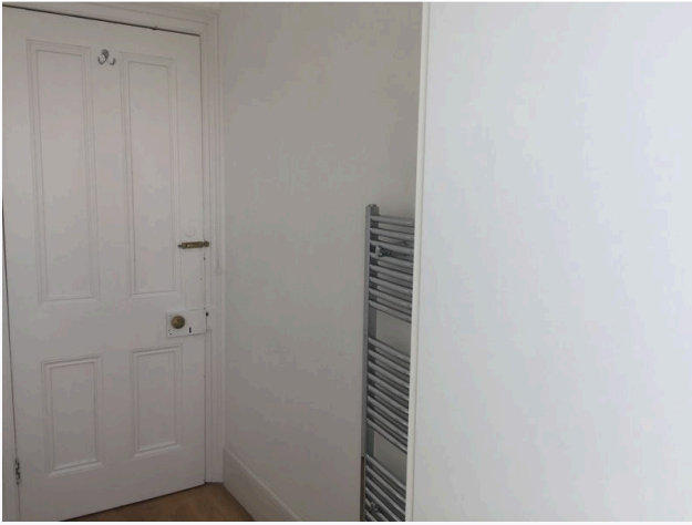
Ref # 2.4