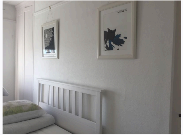
Ref # 2.3