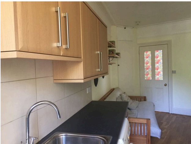
Ref # 2.2