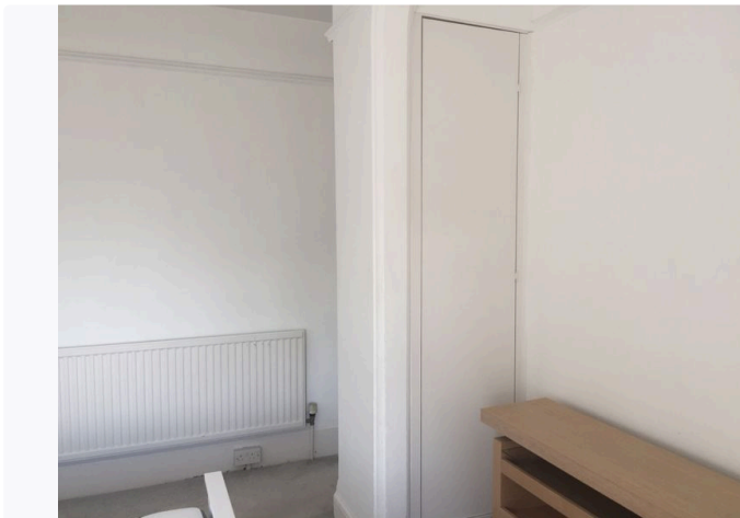
Ref # 2.3