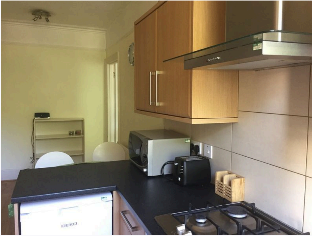
Ref # 2.2