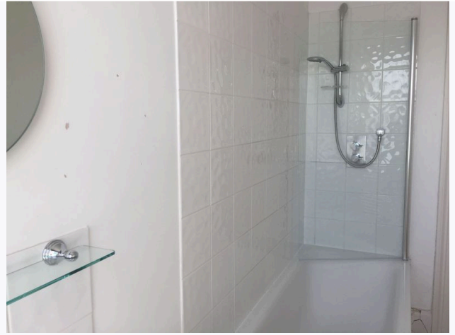
Ref # 2.4